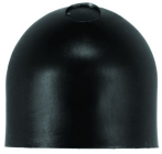
6LV1352 Light Shield for Button Photocontrol (K4000 Series, K4321, K4400 Series, EK4036S, EK4336S, EK4436SM)