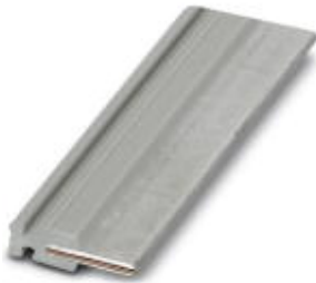
Plug-in bridge, length: 50 mm, color: gray

Please be informed that the data shown in this PDF Document is generated from our Online Catalog. Please find the complete data in the user's documentation. Our General Terms of Use for Downloads are valid ( http://phoenixcontact.com/download )