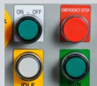
Raised panel labels and more