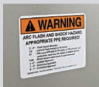
Arc flash labeling