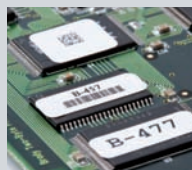
Circuit board labeling