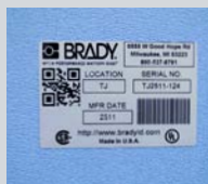
Product ID labels