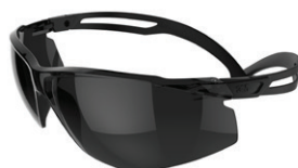
SF502AF-BLK Lens: Gray Frame Color: Black