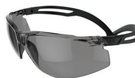
SF507AF-BLK Lens: Indoor/Outdoor Gray Frame Color: Black