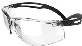
SF501AF-BLK Lens: Clear Frame Color: Black