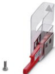
Protective cover for crimping machine CF 500, for tube lugs 0.34 - 2.5 mm 2 (RCT 2.5)

Please be informed that the data shown in this PDF Document is generated from our Online Catalog. Please find the complete data in the user's documentation. Our General Terms of Use for Downloads are valid ( http://phoenixcontact.com/download )