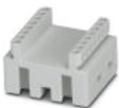
Lateral extension of the height extension for Comfort device adapter, width: 45 mm