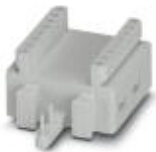
Height extension for Comfort device adapter, width: 45 mm