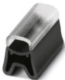
Conductor marker carrier, transparent/black, unlabeled, mounting type: slide-on, cable diameter range: 2 ... 4 mm, lettering field size: 10 x 4 mm

Please be informed that the data shown in this PDF Document is generated from our Online Catalog. Please find the complete data in the user's documentation. Our General Terms of Use for Downloads are valid ( http://phoenixcontact.com/download )