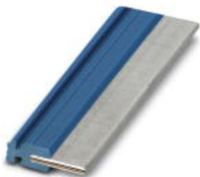
Plug-in bridge, length: 50 mm, color: blue

Please be informed that the data shown in this PDF Document is generated from our Online Catalog. Please find the complete data in the user's documentation. Our General Terms of Use for Downloads are valid ( http://phoenixcontact.com/download )