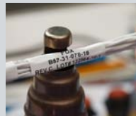
PermaSleeve® wire markers