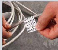
Voice and data communications