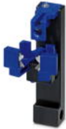
Replacement processing insert 2.5 mm 2 , for the crimping device CF 3000-2,5

Please be informed that the data shown in this PDF Document is generated from our Online Catalog. Please find the complete data in the user's documentation. Our General Terms of Use for Downloads are valid ( http://phoenixcontact.com/download )