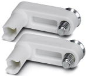
Replacement cable guide 0.5 mm 2 , for sleeve feed CF 3000 HZG 0,5

Please be informed that the data shown in this PDF Document is generated from our Online Catalog. Please find the complete data in the user's documentation. Our General Terms of Use for Downloads are valid ( http://phoenixcontact.com/download )