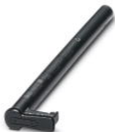
Battery for ITC 8113 xxx with 4 cells and charge level indicator.

Please be informed that the data shown in this PDF Document is generated from our Online Catalog. Please find the complete data in the user's documentation. Our General Terms of Use for Downloads are valid ( http://phoenixcontact.com/download )