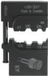
Die, for CRIMPFOX-M, for coaxial connectors

Please be informed that the data shown in this PDF Document is generated from our Online Catalog. Please find the complete data in the user's documentation. Our General Terms of Use for Downloads are valid ( http://phoenixcontact.com/download )