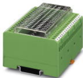
Diode module, for extension with 32 1N 4007 diodes, common cathode

Please be informed that the data shown in this PDF Document is generated from our Online Catalog. Please find the complete data in the user's documentation. Our General Terms of Use for Downloads are valid ( http://phoenixcontact.com/download )