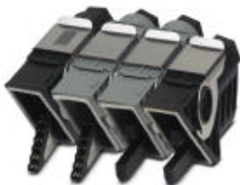
The figure shows various product versions

Connector for the copper wire bus and for the power supply with QUICKON connection method