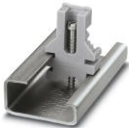
End clamp, width: 8.5 mm, color: gray

Please be informed that the data shown in this PDF Document is generated from our Online Catalog. Please find the complete data in the user's documentation. Our General Terms of Use for Downloads are valid ( http://phoenixcontact.com/download )