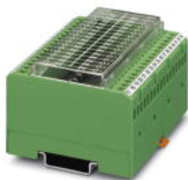
Diode module, with 32 diodes, common anode, diode type 1N 4007

Please be informed that the data shown in this PDF Document is generated from our Online Catalog. Please find the complete data in the user's documentation. Our General Terms of Use for Downloads are valid ( http://phoenixcontact.com/download )