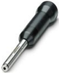
Rivet setting tool, for use with RVT-PA 4 plastic body-bound rivets

Please be informed that the data shown in this PDF Document is generated from our Online Catalog. Please find the complete data in the user's documentation. Our General Terms of Use for Downloads are valid ( http://phoenixcontact.com/download )