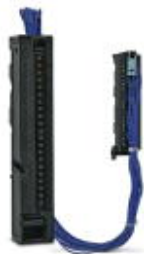
Migration adapter for converting Allen Bradley PLC-5 (1771-WH) to Siemens SIMATIC® S7-1500 front connector. 1771-OAD / 1771-OMD to 6ES7 522-5HH00-0AB0 conversion, cable length: 0.5 m

Please be informed that the data shown in this PDF Document is generated from our Online Catalog. Please find the complete data in the user's documentation. Our General Terms of Use for Downloads are valid ( http://phoenixcontact.com/download )