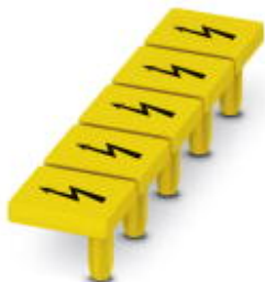
Warning label, yellow/black, labeled: Lightning flash, mounting type: plug in, for terminal block width: 8.2 mm

Please be informed that the data shown in this PDF Document is generated from our Online Catalog. Please find the complete data in the user's documentation. Our General Terms of Use for Downloads are valid ( http://phoenixcontact.com/download )