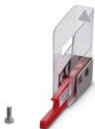
Protective cover for crimping machine CF 500, for ferrules 0.25 - 6 mm 2 (AI 6...)

Please be informed that the data shown in this PDF Document is generated from our Online Catalog. Please find the complete data in the user's documentation. Our General Terms of Use for Downloads are valid ( http://phoenixcontact.com/download )