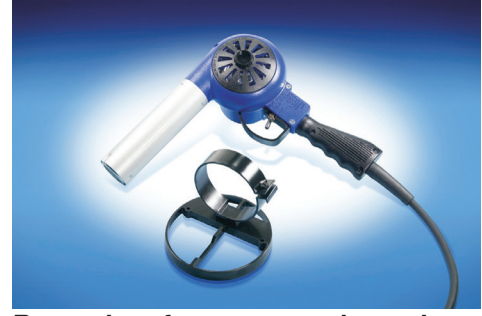
Rugged performance, prolonged use, lighter than other similar models.