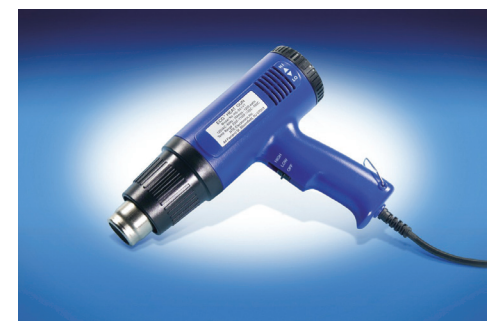
Compact, lightweight, easy to use.