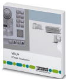
Development license for Visu+ projects.

Please be informed that the data shown in this PDF Document is generated from our Online Catalog. Please find the complete data in the user's documentation. Our General Terms of Use for Downloads are valid ( http://phoenixcontact.com/download )