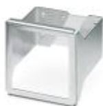
DIN rail adapter for EEM-MA600 and EEM-MA400 energy meters

DIN rail adapter - EEM-MKT-DRA - 2902078