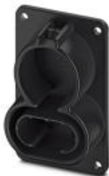
Park position, Retainer for Vehicle Connector as parking position at charging stations (EVSE), CCS type 1, SAE J1772, Front mounting

Please be informed that the data shown in this PDF Document is generated from our Online Catalog. Please find the complete data in the user's documentation. Our General Terms of Use for Downloads are valid ( http://phoenixcontact.com/download )