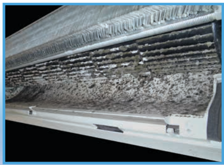
Mold thrives on mini-split blower wheels