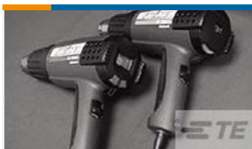
TE Model / Part # CJ2087-000 HL2010E-KIT-120V