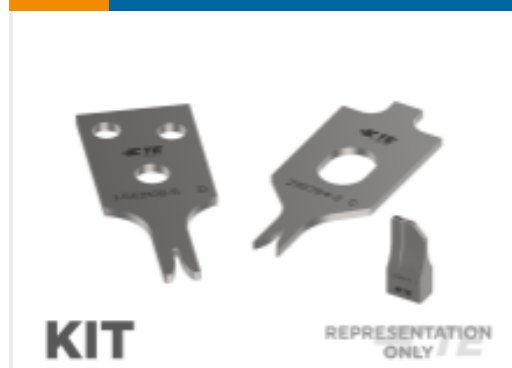
TE Model / Part # 7-2836223-7 OCEAN_2.0_SPARE_PART_KIT-100F140F