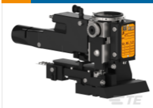
TE Model / Part # 2-2836223-2 OCEAN_2.0_Applicator-S-100F140F