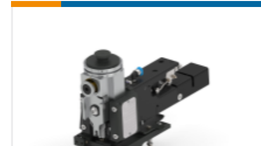
TE Model / Part #2836577-1 OCEAN-2.0-APPLICATOR-S-070F130F