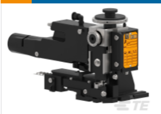
TE Model / Part # 2836223-2 OCEAN_2.0_Applicator-S-100F140F