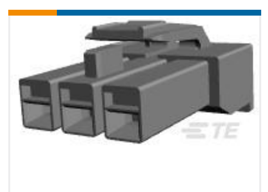
TE Model / Part #176272-9 AMP UNIVERSAL POWER PLUG 3P