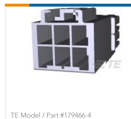
AMP POWER DBL LOCK CAP HSG 6P