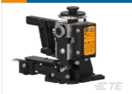
TE Model / Part # 2266557-1 OC-AT-S-FM-132SP150SP-001-0056