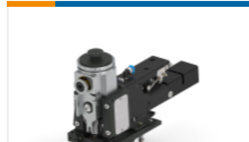
TE Model / Part #2836577-1 OCEAN-2.0-APPLICATOR-S-070F130F