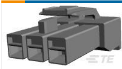
TE Model / Part #176272-9 AMP UNIVERSAL POWER PLUG 3P