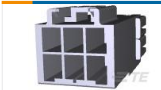
TE Model / Part #179466-4 AMP POWER DBL LOCK CAP HSG 6P