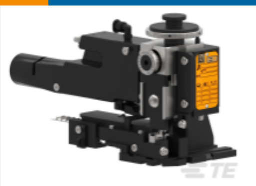
TE Model / Part # 2266557-2 OC-AT-S-FA-132SP150SP-001-0056