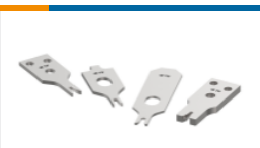
CRIMPER REPRESENTATION ONLY