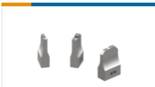
ANVIL REPRESENTATION ONLY