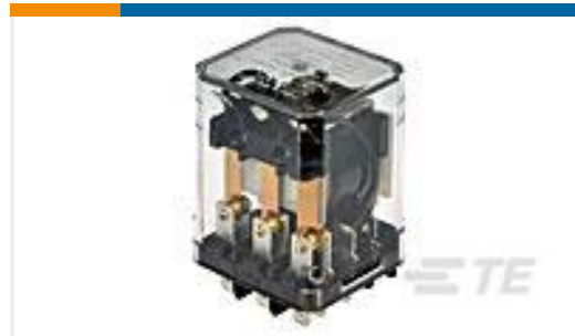
TE Model / Part #7-1393116-2 KUMP-11D18-24=KU-