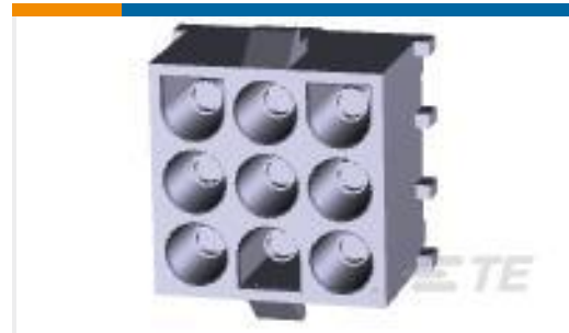
TE Model / Part #350990-4 09P UMNL HDR ASSY LNG/TL