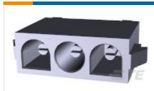
TE Model / Part #350583-1 03P UMNL PIN HDR ASSY V2 NATL