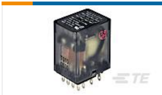
TE Model / Part #5-1393122-7 KHAU-17D12-24=KH