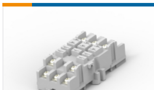
TE Model / Part #2-1419106-5 27E893=SOCKET,KU,11,QC,POLY,NA-