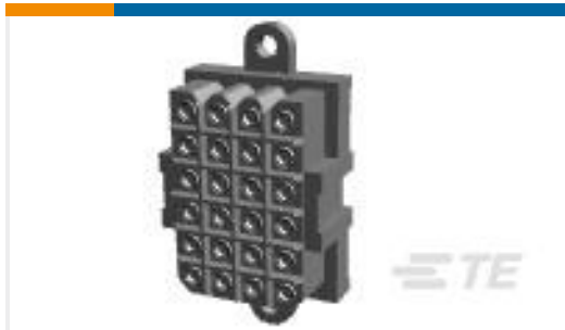
TE Model / Part #207532-8 SKT HDR ASSY,24 POSN,METRIMATE