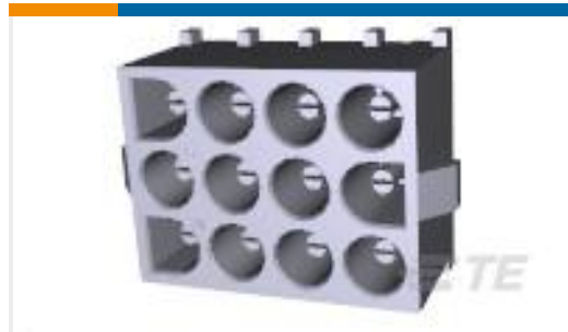
TE Model / Part #350587-1 12P UMNL PIN HDR ASSY V2 NATL