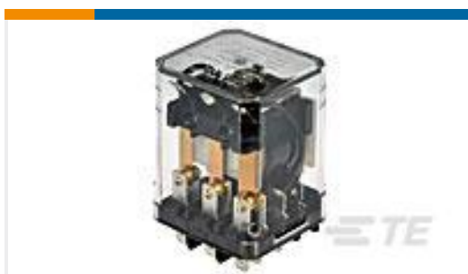
TE Model / Part #8-1393116-4 KUMP-14A18-120=KU