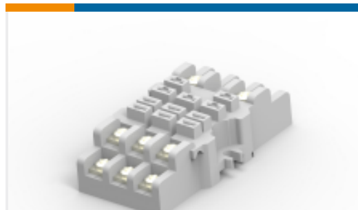
TE Model / Part #1393143-5 27E121=SOCKET,KUP,11,SCW,PLE