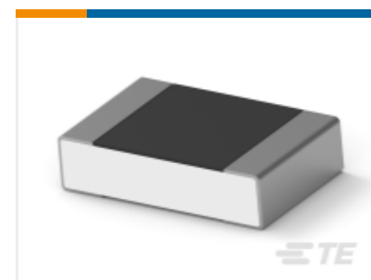
TE Model / Part #4-2176381-5 RQ 0805 35K7 0.1% 10PPM 5K RL