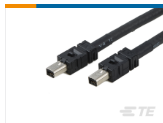
TE Model / Part #2-2205131-2 CA MINI IO MINI IO TYPE I