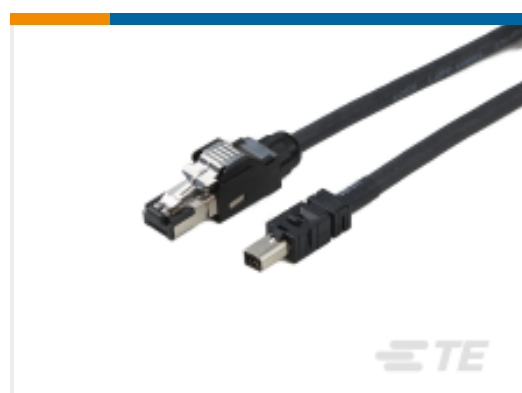
TE Model / Part #2-2205133-1 CA MINI IO TYPE I IND RJ45