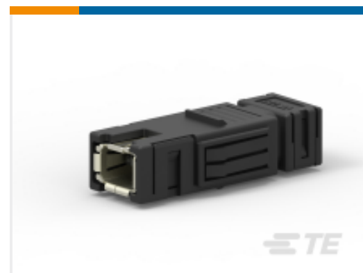
TE Model / Part # CAT-IN291-M6641L Mini I/O Receptacle Kit Type 2 Piercing