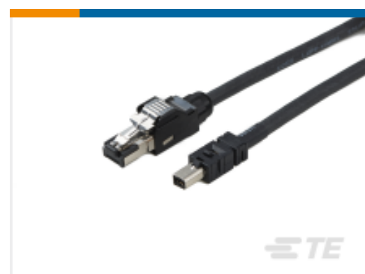
TE Model / Part #2-2205133-3 CA MINI IO TYPE I IND RJ45