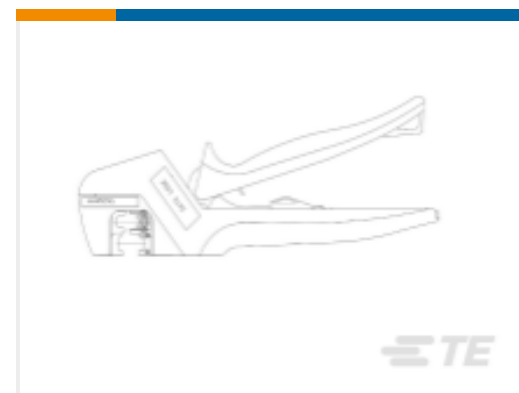
TE Model / Part # 2229737-1 MINI I/O PIERCING TYPE HAND TOOL