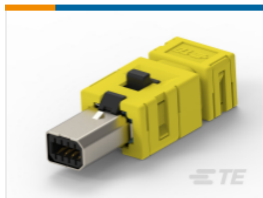
TE Model / Part # CAT-IN291-M6641 Mini I/O Cable Conn. Piercing D1