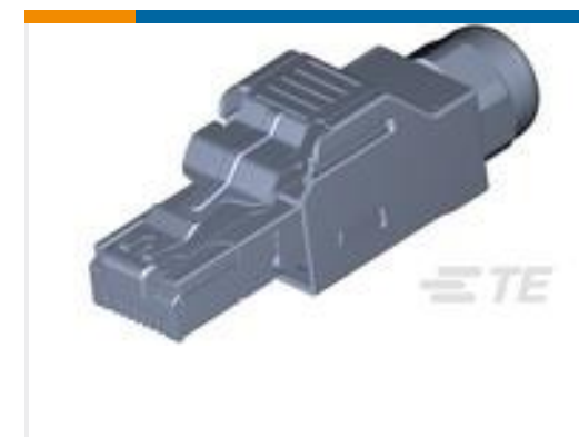
TE Model / Part # 1903527-1 IE RJ45 CONNECTOR IP20 8POS 180DEG