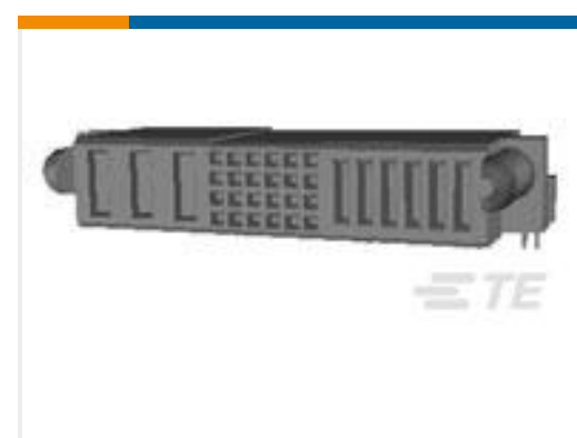
TE Model / Part #6450880-1 MBXLE R/A RCPT 6LP + 24S + 3P