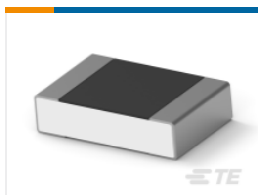
TE Model / Part #7-2176381-4 RQ 0805 71K5 0.1% 10PPM 5K RL