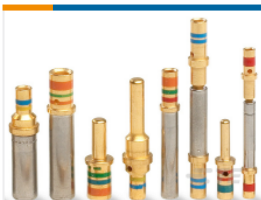
TE Model / Part #ZPF000000000001263 097-0267-20