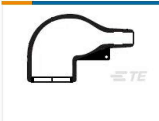
TE Model / Part #486635-000 222K152-25-G13-0