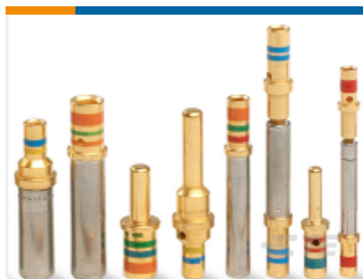
TE Model / Part #ZPF000000000001259 097-0266-20