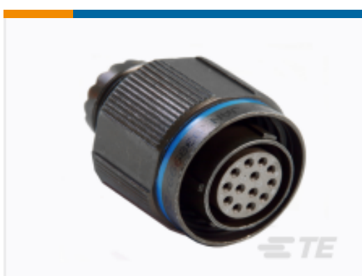
TE Model / Part #ZPF0000000000017171 DTS 26 K 25-04 BA