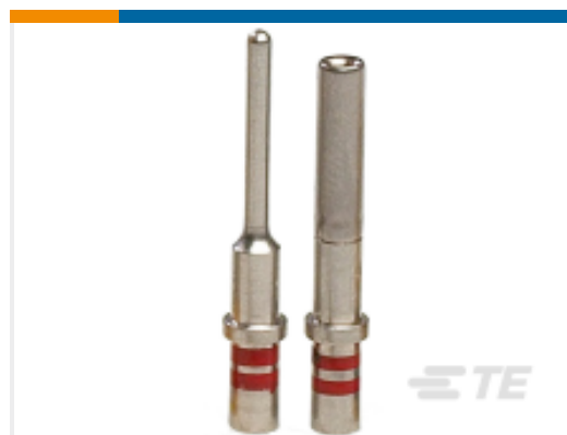
TE Model / Part #ZPF000000000001224 097-0104-16