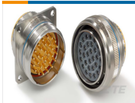
TE Model / Part #ZPF000000000008179 983-6K 28-42 P7 L