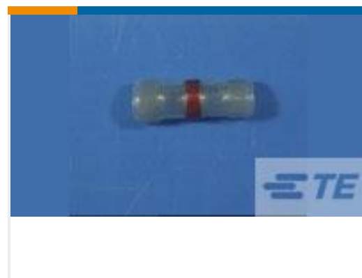
TE Model / Part #620080N004 D-108-12CS948