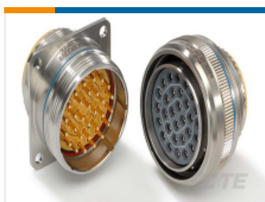
TE Model / Part #ZPF9000000000008639 983-6S 18-08 PN-L-A1263