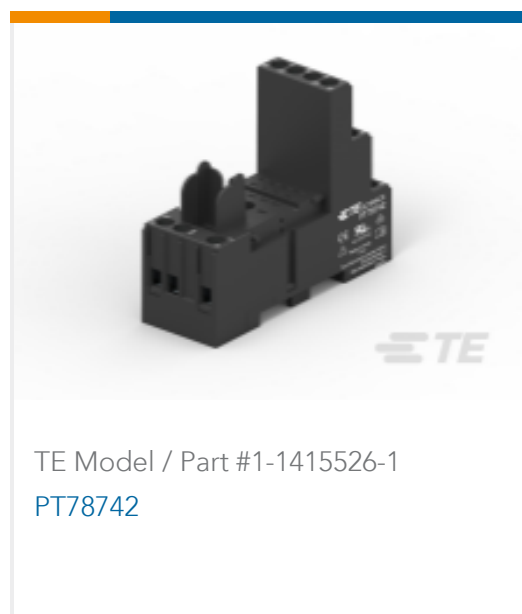
TE Model / Part #1-1415526-1 PT78742