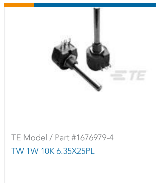
TE Model / Part #1676979-4 TW 1W 10K 6.35X25PL