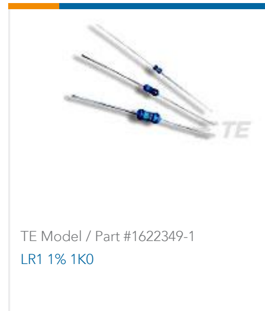
TE Model / Part #1622349-1 LR1 1% 1K0