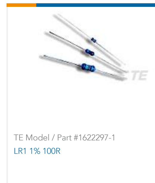
TE Model / Part #1622297-1 LR1 1% 100R