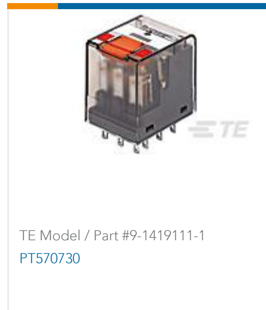
TE Model / Part #9-1419111-1 PT570730