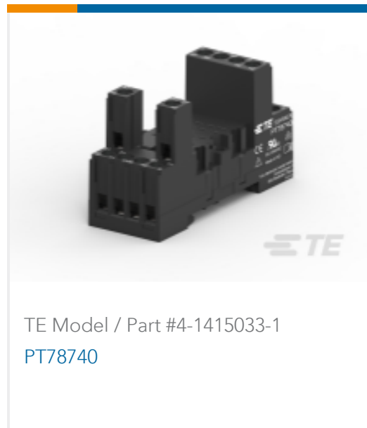
TE Model / Part #4-1415033-1 PT78740