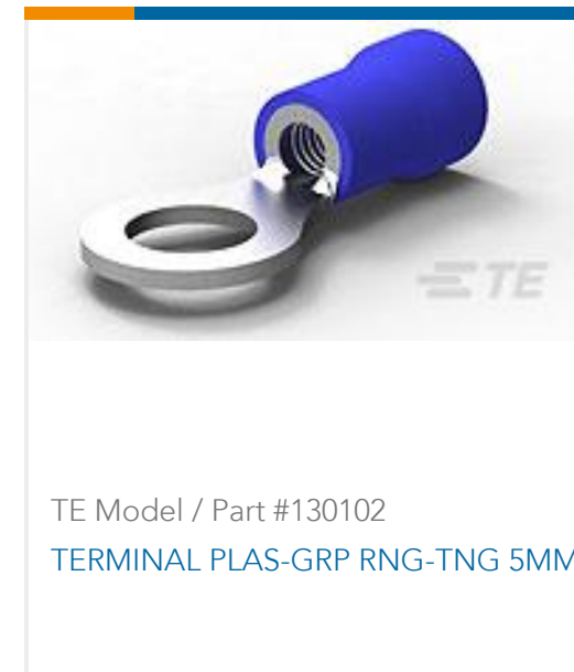
TE Model / Part #130102 TERMINAL PLAS-GRP RNG-TNG 5MM