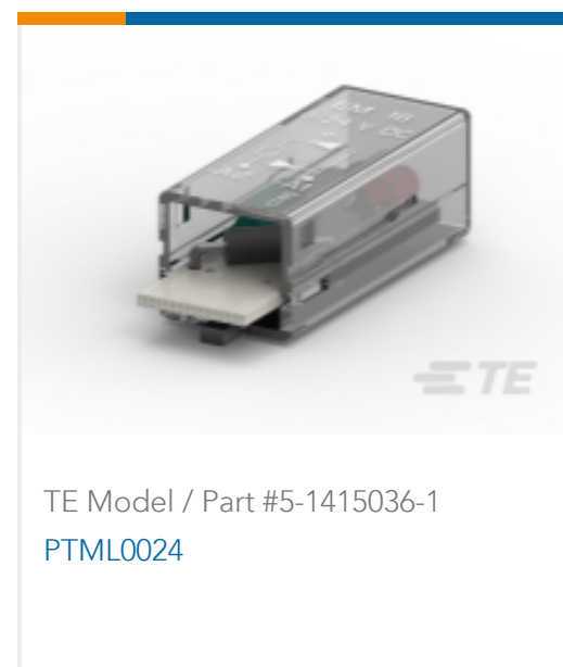
TE Model / Part #5-1415036-1 PTML0024