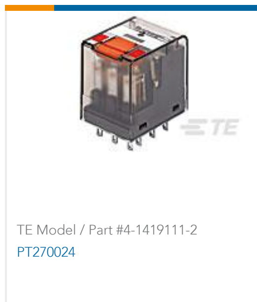
TE Model / Part #4-1419111-2 PT270024