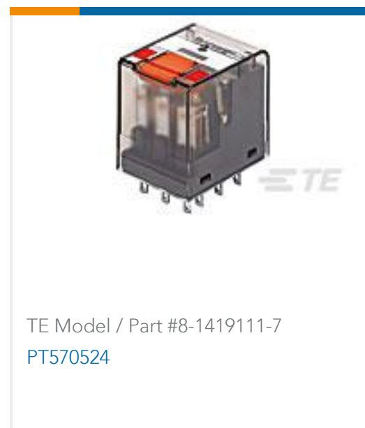
TE Model / Part #8-1419111-7 PT570524