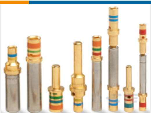
TE Model / Part #2562-214-2031 CONT SOC ASSY