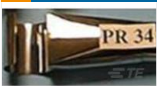
TE Model / Part #989111-000 PR-34-REFLECTOR