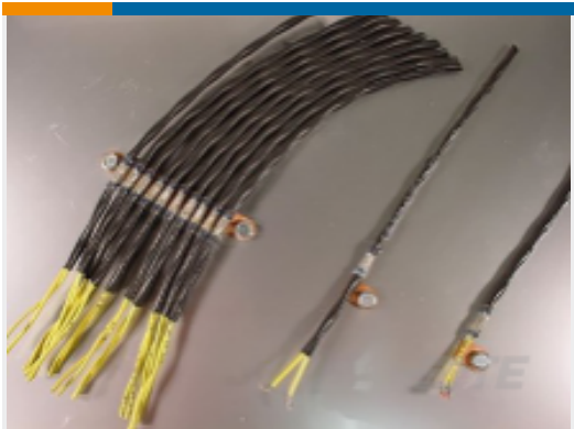
TE Model / Part #691437-000 B-500-06-01