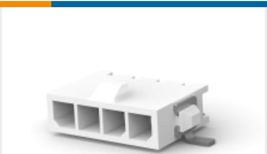
TE Model / Part #2029076-4 4P MICRO MNL 1R RA HDR ASY NAT