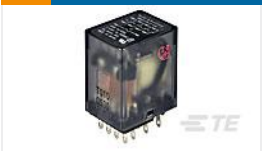
TE Model / Part #2-1393122-7 KHAU-17A12-12=KH