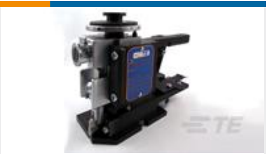
TE Model / Part #2150357-1 OCEAN_2.0_Applicator-E-070F