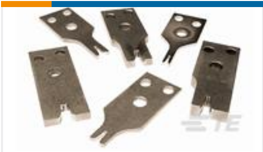
TE Model / Part #1-456411-4 CRIMPER, WIRE .140"