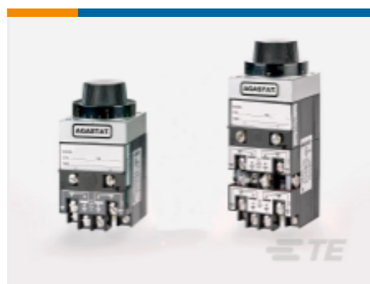
TE Model / Part # 2-1423162-9 7022BK=RLY,STD,OFF,M2P,240VAC,