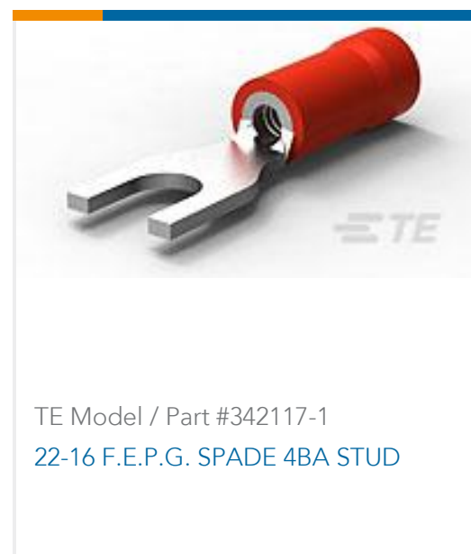
TE Model / Part #342117-1 22-16 F.E.P.G. SPADE 4BA STUD