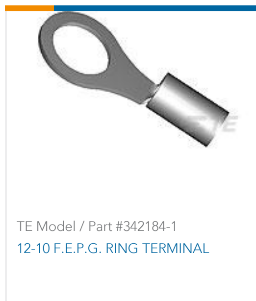
TE Model / Part #342184-1 12-10 F.E.P.G. RING TERMINAL