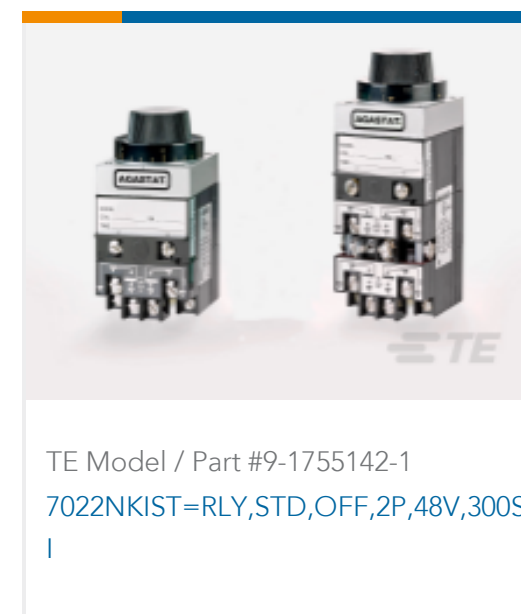
TE Model / Part #9-1755142-1 7022NKIST=RLY,STD,OFF,2P,48V,300S, I