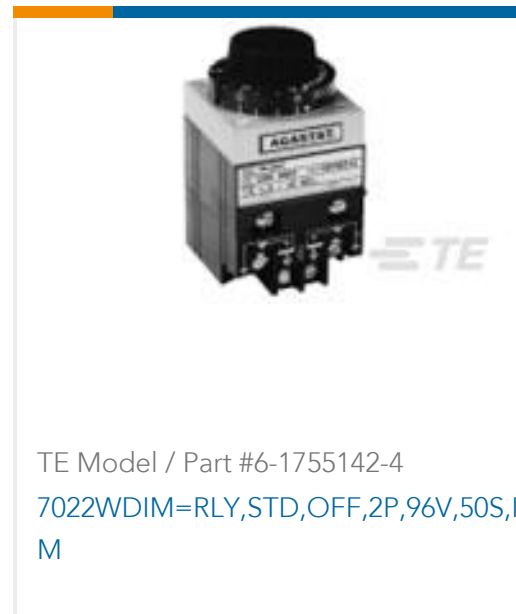
TE Model / Part #6-1755142-4 7022WDIM=RLY,STD,OFF,2P,96V,50S,I, M