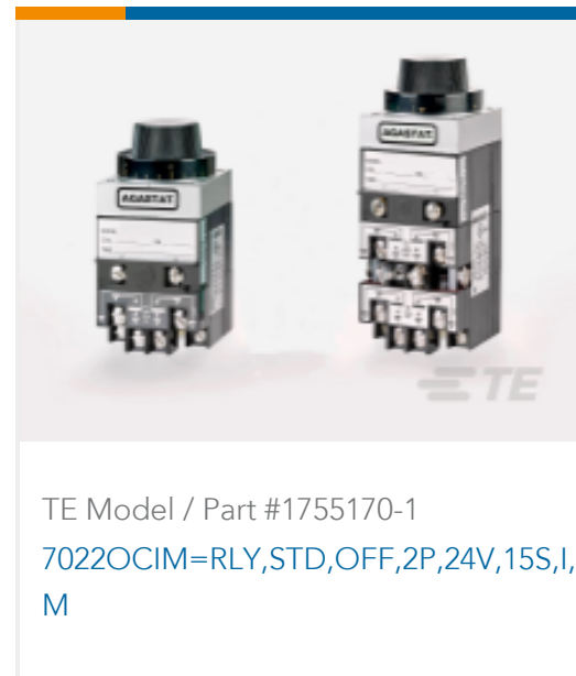
TE Model / Part #1755170-1 7022OCIM=RLY,STD,OFF,2P,24V,15S,I, M