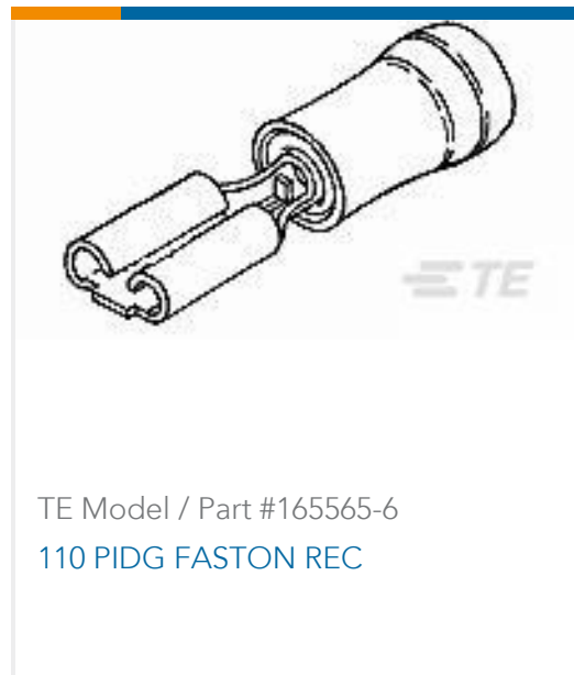
TE Model / Part #165565-6 110 PIDG FASTON REC