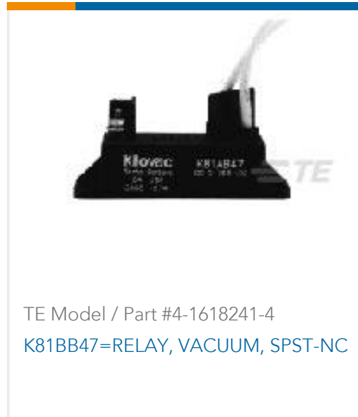
TE Model / Part #4-1618241-4 K81BB47=RELAY, VACUUM, SPST-NC