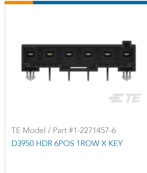
TE Model / Part #1-2271457-6 D3950 HDR 6POS 1ROW X KEY