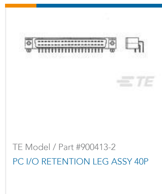
TE Model / Part #900413-2 PC I/O RETENTION LEG ASSY 40P