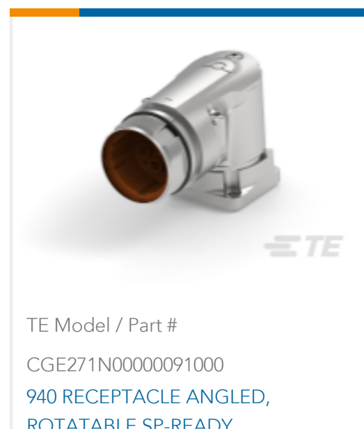
TE Model / Part # CGE271N00000091000 940 RECEPTACLE ANGLED, ROTATABLE, SP-READY