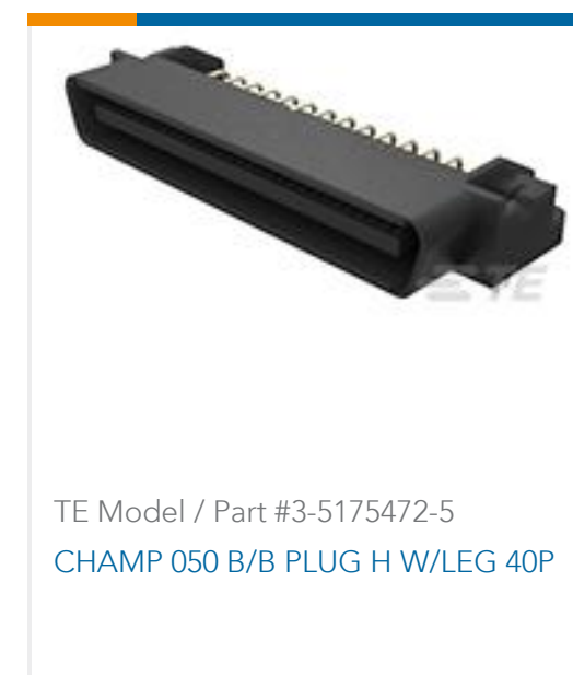
TE Model / Part #3-5175472-5 CHAMP 050 B/B PLUG H W/LEG 40P