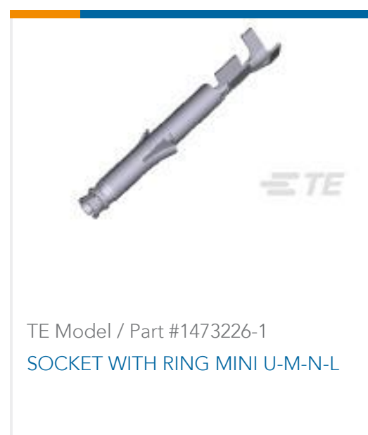
TE Model / Part #1473226-1 SOCKET WITH RING MINI U-M-N-L