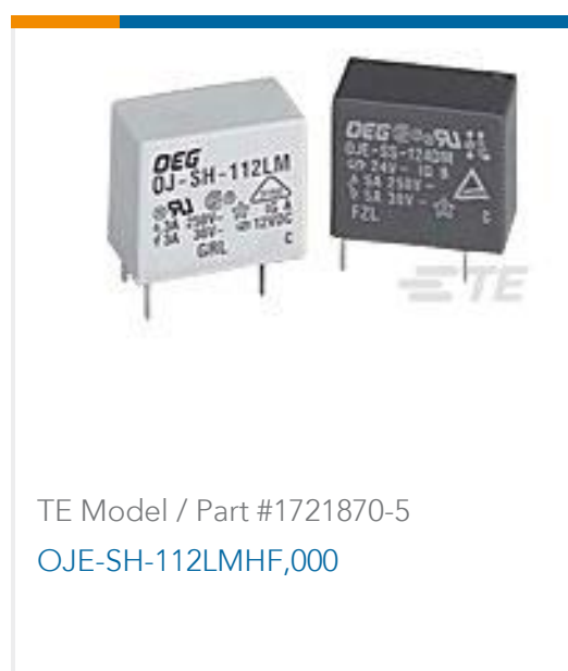
TE Model / Part #1721870-5 OJE-SH-112LMHF,000