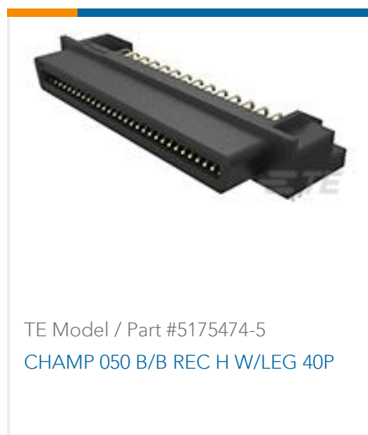
TE Model / Part #5175474-5 CHAMP 050 B/B REC H W/LEG 40P