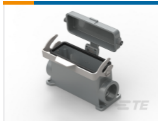
TE Model / Part #T1660243232-000 H24B-SDRH-LB-2M32