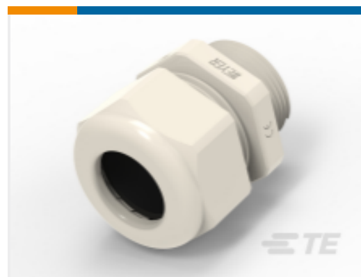
TE Model / Part #T3209091201-000 HSK-P09G