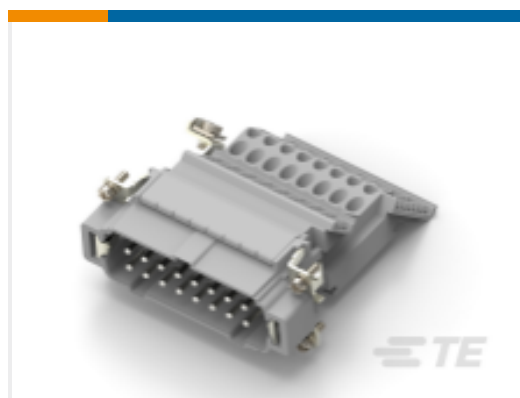
TE Model / Part #T2100163101-000 HEAV-016-MS