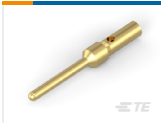
TE Model / Part #T2070011008-000 DAM-08