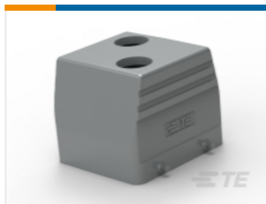
TE Model / Part #T1220320225-000 H32B-TG-2M25