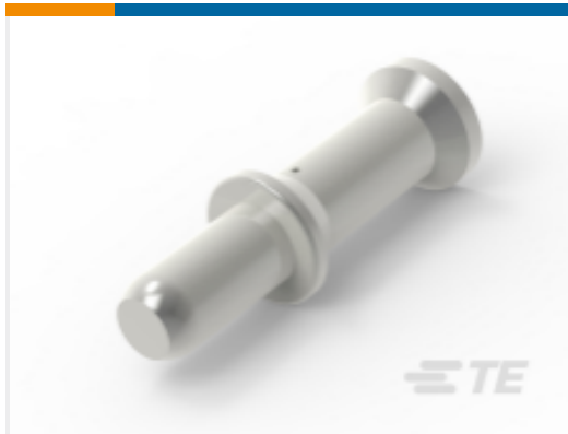
TE Model / Part #T2050001010-000 CNM-10