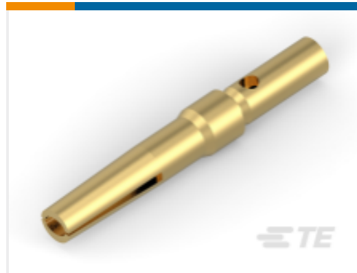
TE Model / Part #T2070012008-000 DAF-08