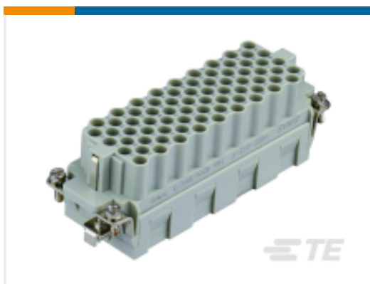
TE Model / Part #T2050722201-000 HEEE-072-F