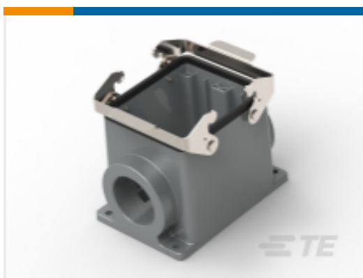
TE Model / Part #T1440322232-000 H32B-SGR-2M32