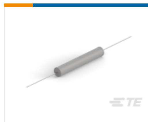
TE Model / Part #2-2176416-0 9W STD M/OX 5% 330R