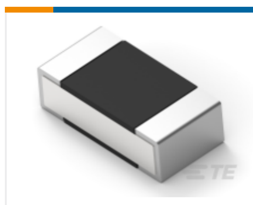
TE Model / Part #9-2176305-7 RP 1E 0.1W 1K07 0.1% 25PPM 5K RL