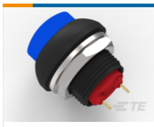
TE Model / Part #2-2329328-0 PB OFF/ON HC BLU M4 TERM. IP68