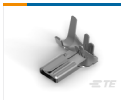
TE Model / Part #2238172-3 FAST .187 STD REC RHFLG 2D AWG24-14 TPBR