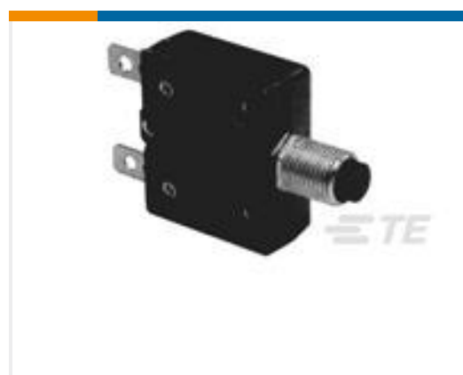
TE Model / Part #5-1423901-9 W54-XB2A4A10-10=CKTBKR,THERM, PB,QC.250