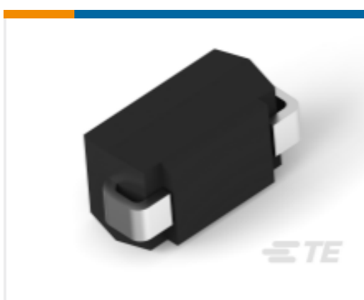
TE Model / Part #1-2176322-2 SMV 1W 820K 5%