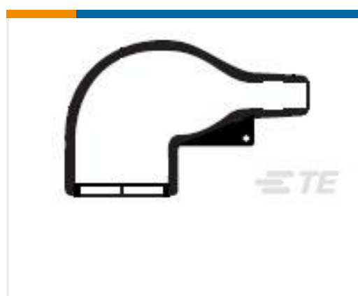
TE Model / Part #636000-000 222K163-100/184-0