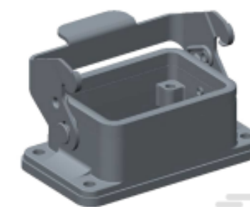
TE Model / Part # T1500063000-000 H6B-AG