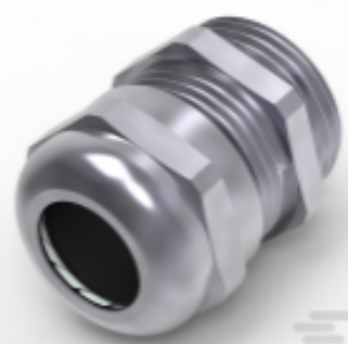
TE Model / Part # T3609160101-000 DLX-16-MS