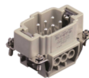
TE Model / Part # T2040062101-000 HE-006-M