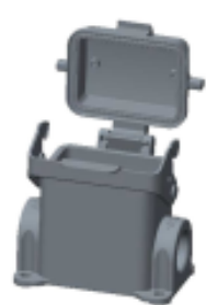
TE Model / Part # T1620063216-000 H6B-SDR-2PG16