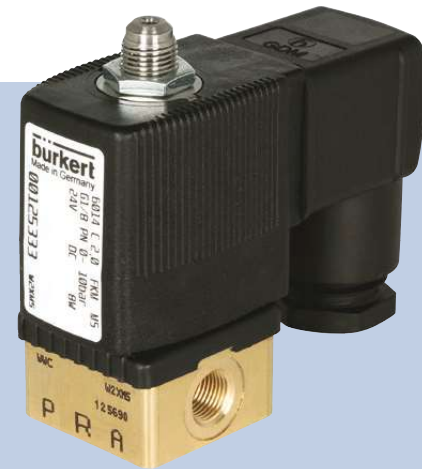
Shown with 2508 plug

Direct-acting 3/2-way, normally closed or normally open solenoid valve. It is for neutral gases and liquids and it is also suitable for technical vacuum.