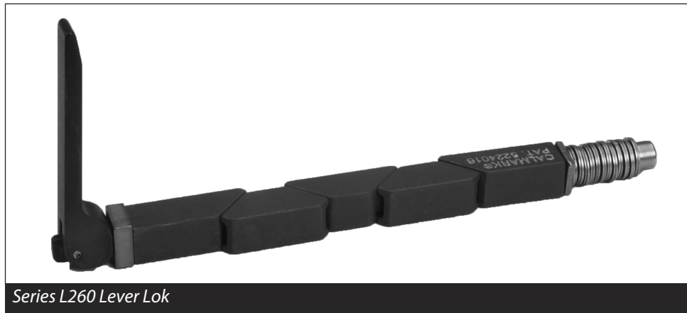
Series L260 Lever Lok