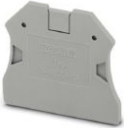
End cover, length: 47 mm, width: 2.2 mm, height: 39.8 mm, color: gray

Please be informed that the data shown in this PDF Document is generated from our Online Catalog. Please find the complete data in the user's documentation. Our General Terms of Use for Downloads are valid ( http://phoenixcontact.com/download )