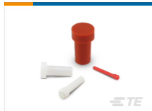
TE Part #114017-ZZ DEUTSCH SEALING PLUGS