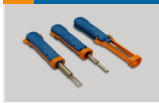
Insertion & Extraction Tools(7)