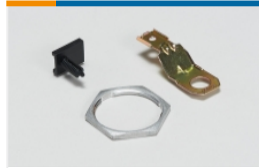
Other Automotive Connector Accessories(13)