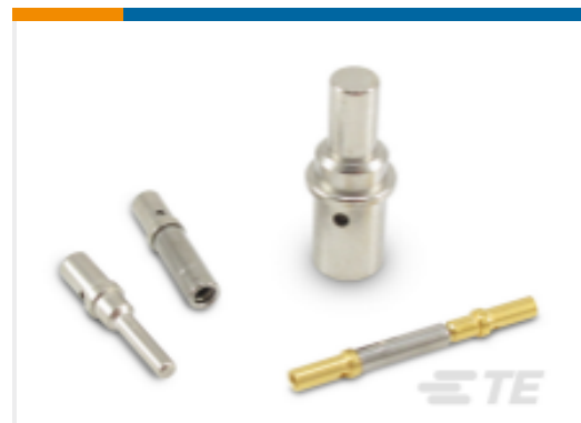
TE Part #0460-202-16141 DEUTSCH SOLID CONTACTS