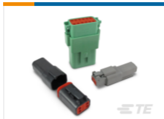
TE Part #DT06-2S DEUTSCH DT HOUSINGS