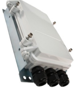
LP-2360 - EXTERNAL

The LAN-Power LP-2340 and LP-2360 PoE and Ethernet Data Segment Extenders enable the extension of both Power over Ethernet (PoE) and Ethernet Data, over standard CAT 5 (or above) cabling, beyond the specified 328 feet (100 meter) lengths for 10/100Base T Networks. They forward both PoE Power and Ethernet Data for one additional 328 feet (100 meter) segment per installed unit. Multiple units can be installed in series for longer distance applications, with no degradation in network speed or added latency. The LP-2340 is designed for internal applications and the LP-2360 , with its weather-resistant enclosure (IP 67 Rated), is designed for external applications. The LP-2360 includes back plate mounting bracket and three (3) external wiring grommets.