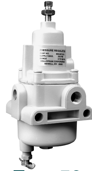
Type 50 Pressure Regulator Series