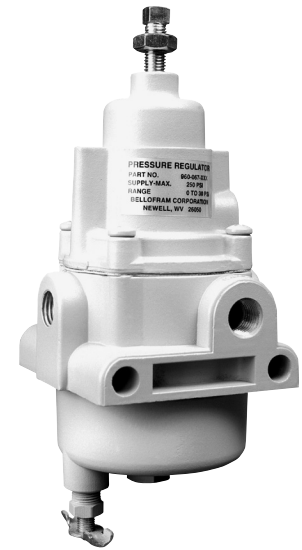
Type 50 Pressure Regulator Series