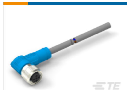
TE Part #T4151410004-002 M12 A-CODE FEMALE R/A SINGLE ENDED CABL