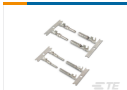
TE Part #1062-16-0177 DEUTSCH STAMPED & FORMED CONTACTS