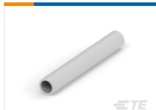
TE Part #5054014010 RNF-3000 Single Wall Stick Heat Shrink