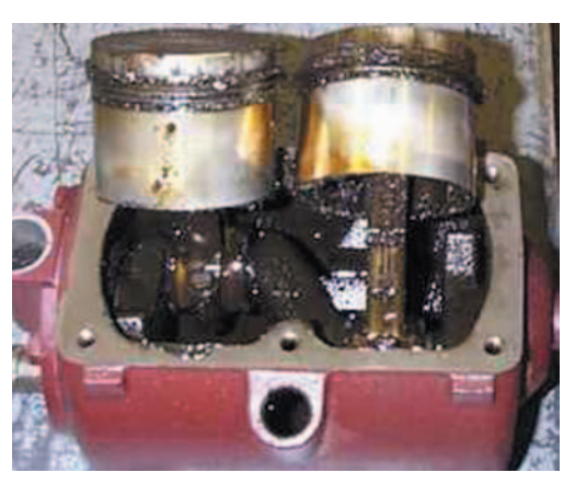
Poor lubricant quality reduces performance

After 250 hours does the inside of your reciprocating compressor look like this? The major concerns of today's compressor owners are efficiency, reliability, low maintenance costs and long life. Poor lubricant quality can affect all of these, yielding results like the picture at the right.